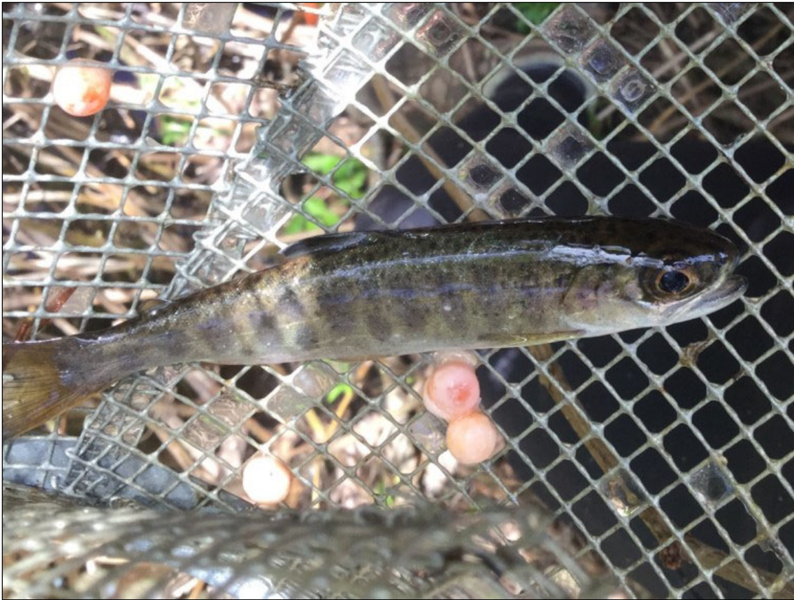
Figure 1.—Juvenile coho salmon captured at waypoint 440.