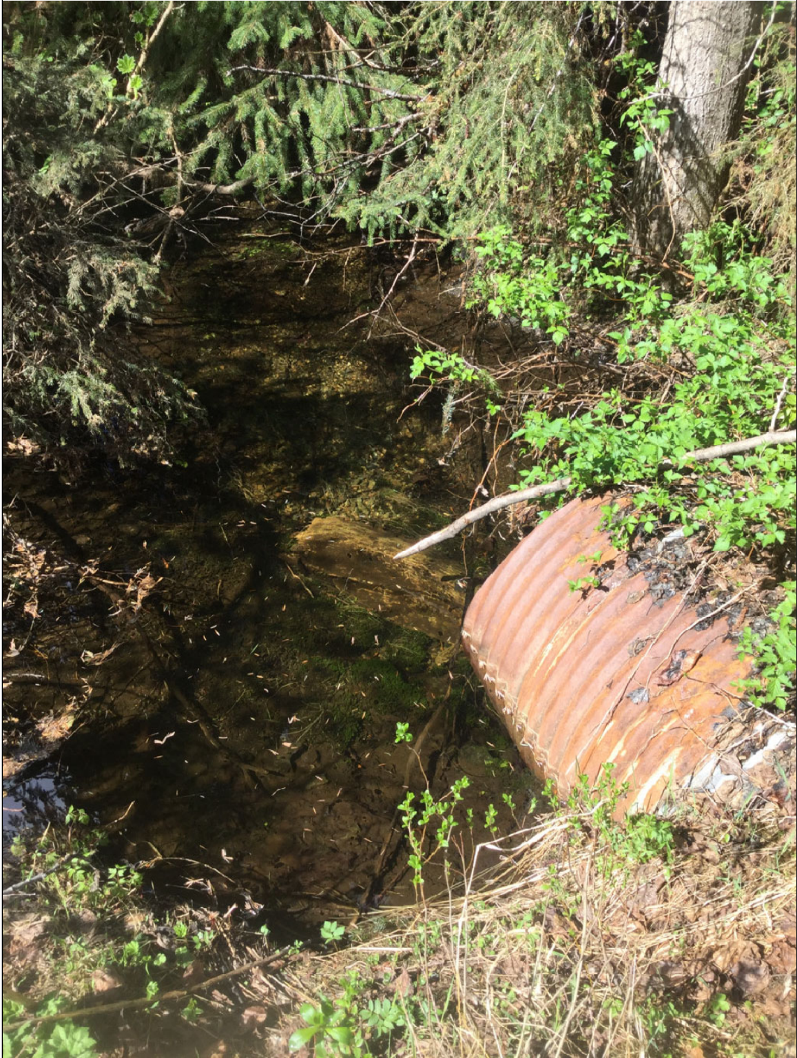
Figure 2.—Culvert inlet at waypoint 440.